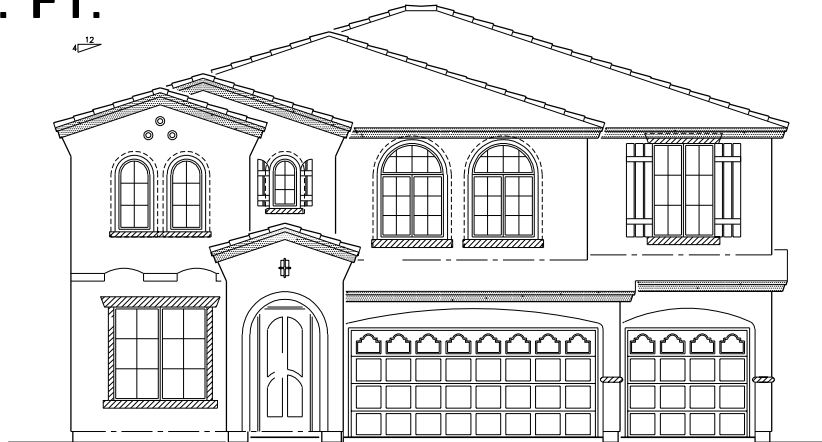
ELEVATION 'A' · VV-4540